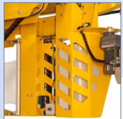
2. Front view of film carriage with “S” wrap threading.

A reliable and economical solution for wrapping pallets. Although compact in size, it is versatile enough to handle a variety of applications. The Octopus is silent in operation and easily maintained. With its color touchscreen controls, it provides unmatched flexibility in creating the optimal wrap pattern for your specific stretch packaging challenge.