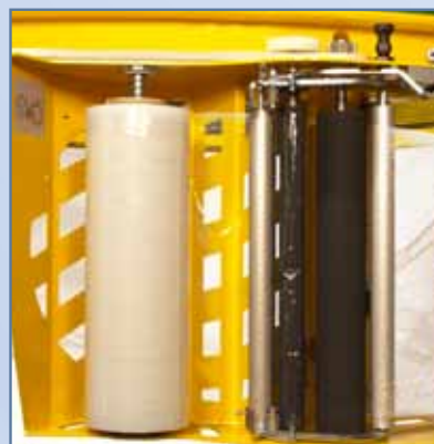
1. Back view of easy load “S” style film carriage with heat seal pad.