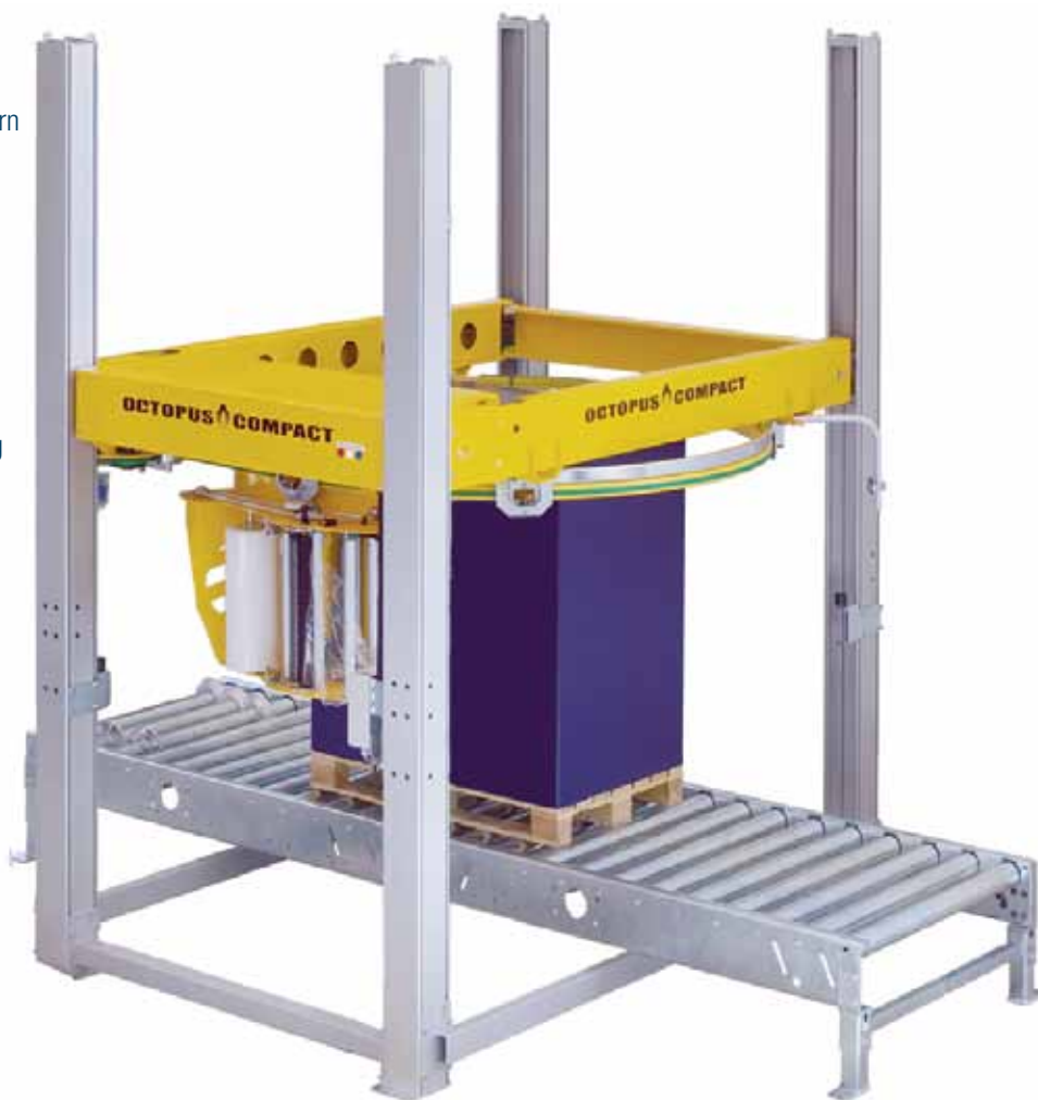
Shown with optional gravity type stabilizer.

Compact, aluminum frame structure along with a well balanced ring and belted lifting device results in quiet, efficient performance and minimal maintenance