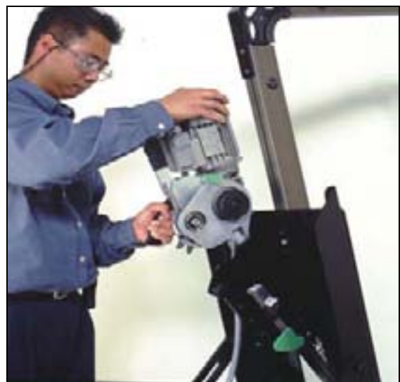
Copier technology - intuitive understanding & simplicity Easy access to strap channel for operators. The feeder unit rarely has to be changed and only weighs 12,5 kg