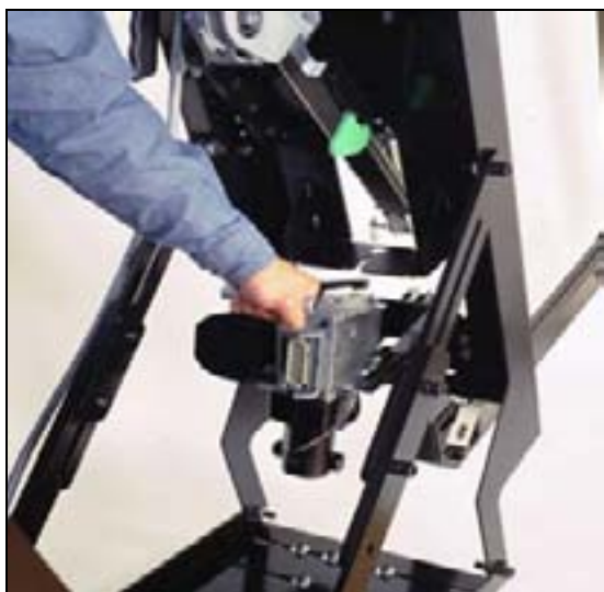
Simple to change the light-weight modules. The sealer weighs only 10 kg so can be changed in less than a minute by anyone