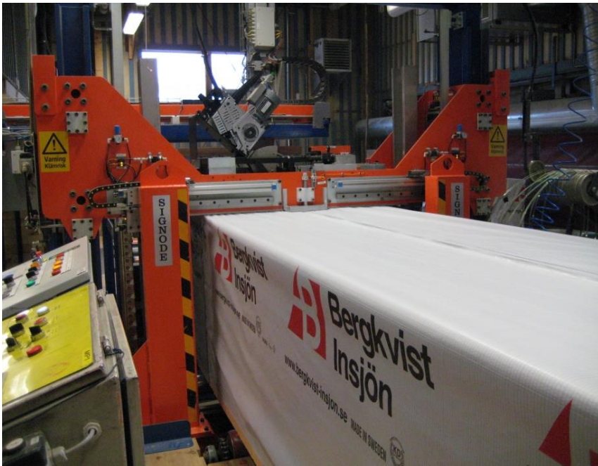
Lumber Hood strapping with 9-12 mm PET strap to secure the load cover